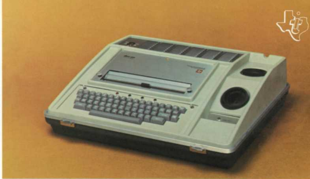
Model 725 portable data terminal includes a built-in acoustic coupler and may be used anywhere a telephone and electrical outlet are available.